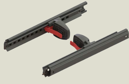
Kayak Recreational Footbrace w/ Rudder Control K747600-1