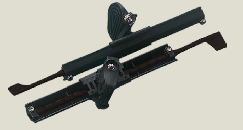
Kayak Adjustable Footbrace w/ Rudder Control K747200B-1