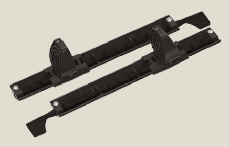
Kayak Adjustable Footbrace Low Profile K747300B-1