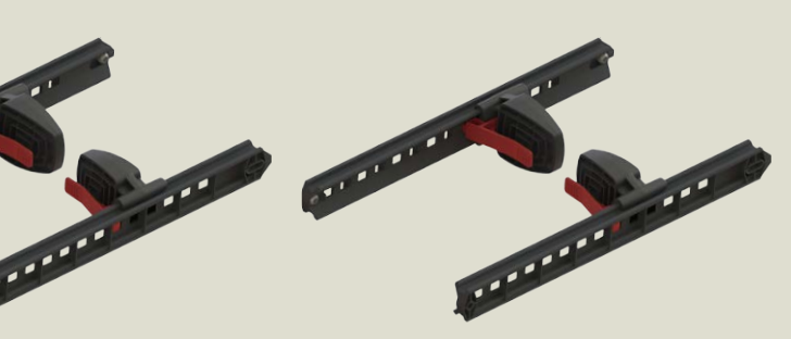
Kayak Recreational Footbrace, Thru Hull K747520-1

To make footbraces easier to sell, we've reduced our number of SKU's, while still providing a full selection to fit your mounting pattern. In our Kayak Adjustable Line, you now have a choice of three basic models. You can also purchase a separate Short Flag Kit (K747380-1) to transform your footbrace and fit those tight cockpits. Or for you boat builders, just purchase a Stud Mount Kit (K747270-1) to glue or glass any footbrace kit in place.